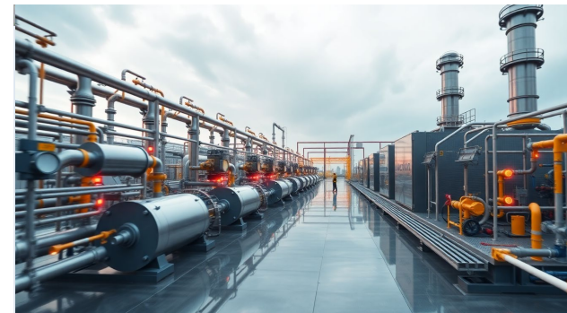
MODULAR PLANT INFRASTRUCTURE