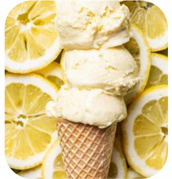
Crisp, creamy, smooth, citrus