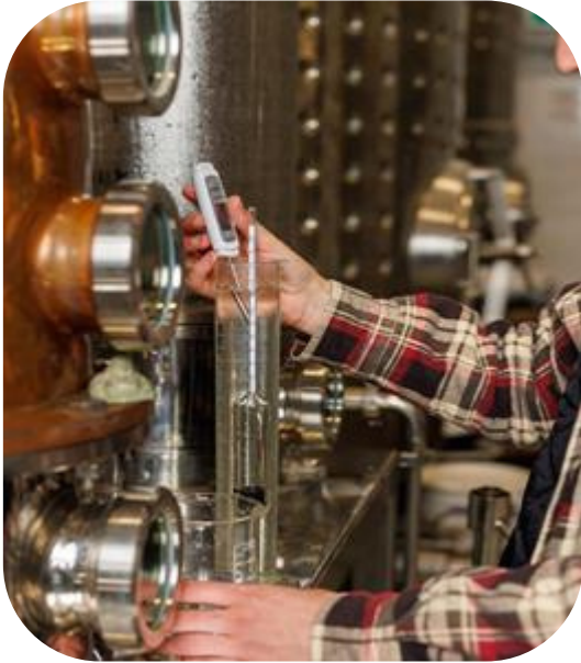
Triple-distilled, pure spirit