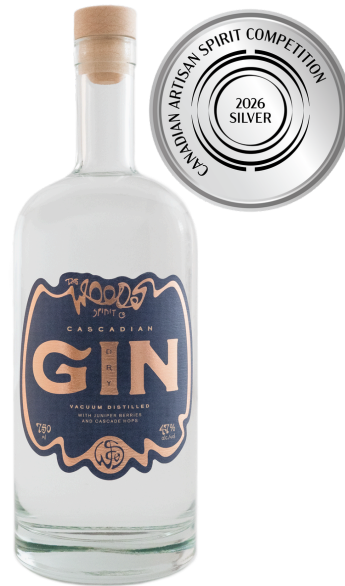
Vacuum-distilled Bulgarian juniper