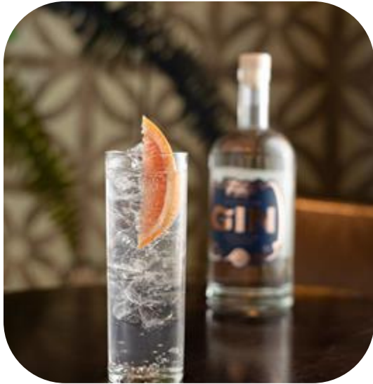
Gin for gin lovers