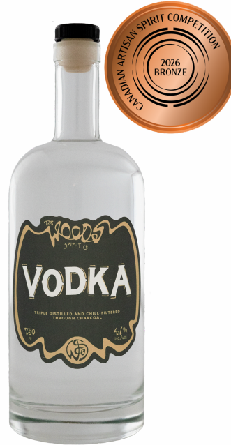
Cold distilled & chill-filtered