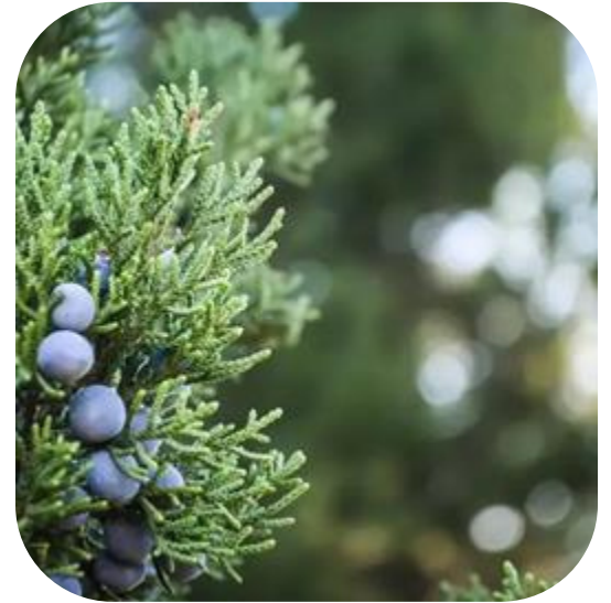
Fresh pine, Cascadian hops, evergreen, citrus